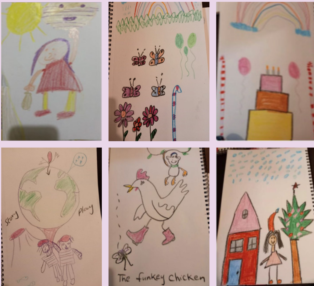
Images From Story Play

When schools opened in August 2021 we resumed our 'school based' support sessions. Issues identified CYP needing support with included living in a domestic abuse environment, struggling at home due to cultural pressures and to conform, sexual identity, sexual abuse, online abuse and abusive relationships. In January 2022- Children started story play session with Lickety-split theatre company who worked with Women's Aid to teach staff how to plan and deliver story play. This was a great opportunity for the workers, mothers, and children. Hemat Gryffe children service jointly co-delivered 6 weeks of play sessions with Shetland Women's Aid and Shakti Women's Aid giving mum's and CYP the opportunity to meet families from Shetland, Edinburgh, and Glasgow.